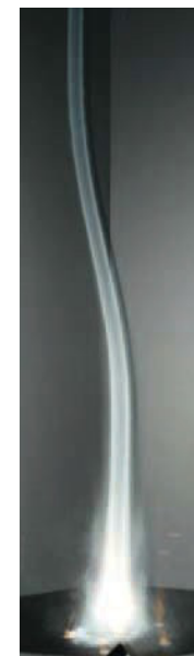
Fig. 2. "Tornado apprivoisée" a 3m high open tornado simulator.

When mediation of scientific ideas is targeting a non-scientific public, the aesthetic may be pushed by adding complexity to the demonstration in order to trigger questioning and not only to give easy answers. For "The Tornado Tamed" demonstrator (Fig. 2), by adding hot colour lights and irregular injections of smoke, the tornado seems to form instantly when smoke is emitted and illuminates the core of the vortex, and to disorganize when smoke reaches the periphery, giving the illusion of an aesthetic life cycle that puzzles observers